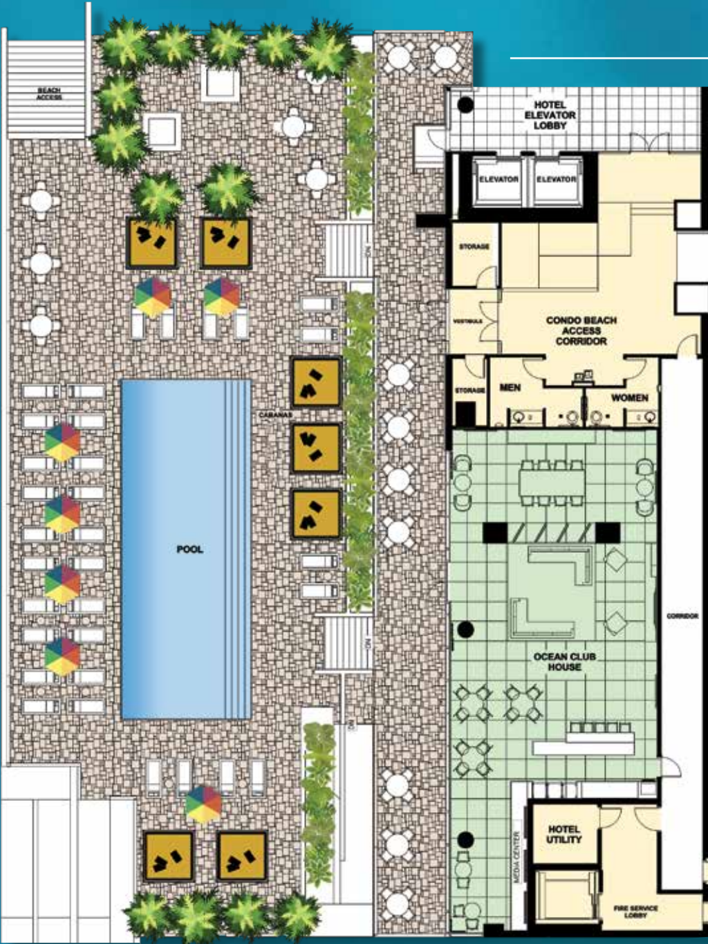
LEVEL 2 Amenities

500 Atlantic Condominium was designed to satisfy the desires of its discriminating owners. 500 Atlantic offers its residents the unique opportunity to indulge in a long list of services provided by the adjacent 4-star Daytona Grande Hotel including: • Room service provided by the hotel restaurants