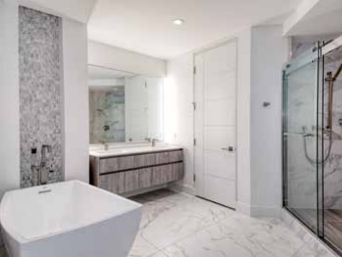
500 Atlantic’s baths include Snaidero cabinetry, Kohler fixtures and a Jacuzzi soaking tub.

In the Seaside Salons the ceiling heights are 8'9". The Seaside Salons do not include Jacuzzi tubs and the appliance package will vary. Please request specific information from the 500 Atlantic Condominium sales representative. All features and square footages are approximate and subject to change without notice. The developer reserves the right to make changes to the standard features and building amenities.