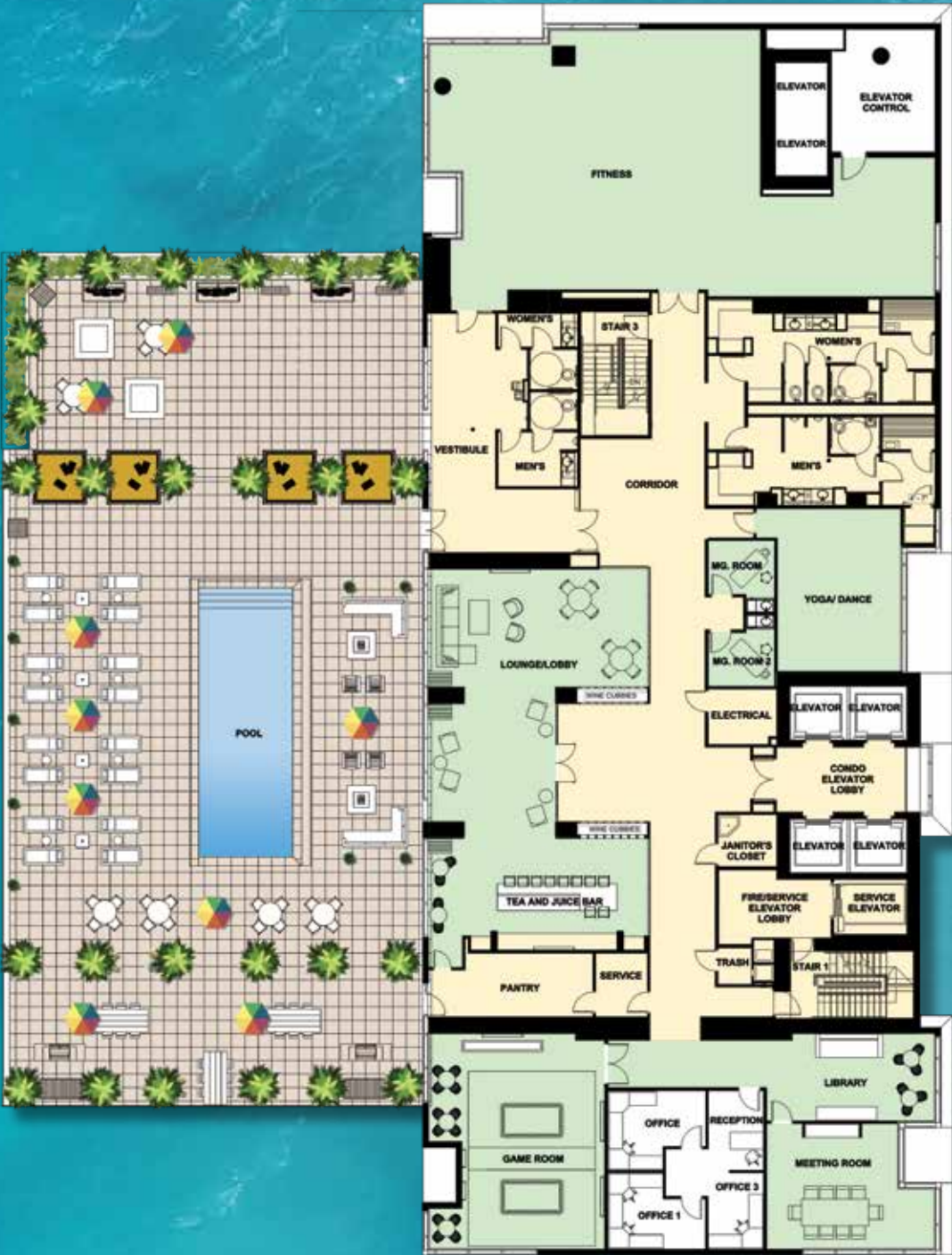
LEVEL 9 Amenities